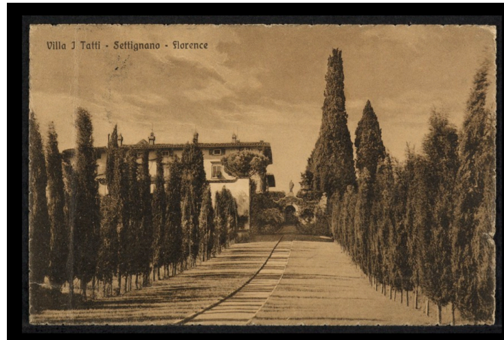
the cypress allée