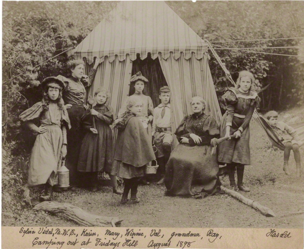
the summer camp at Friday's Hill, August 1895