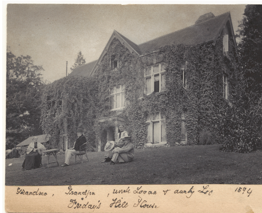
Friday's Hill, 1894