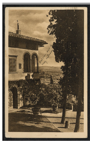
Mary's bedroom at Villa I Tatti